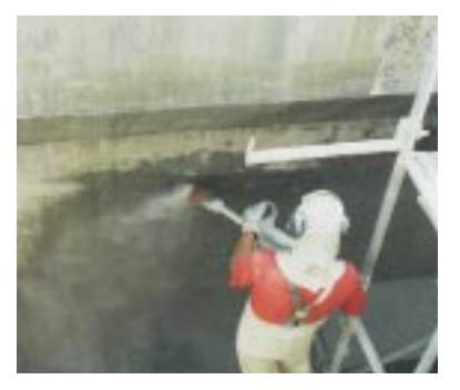
If available use highest waterpressure technology and remove unsound concrete completely. Expose corroded reinforcing steel. Remove rust and clean.