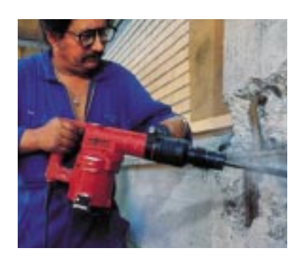
Carefully remove unsound concrete and expose reinforcing steel completely.

The Vandex CRS Concrete Repair Product Data Sheets present, the individual steps in a clear and concise manner providing quick and easy instruction for the user.