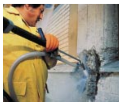
Remove rust and clean reinforcement steel by sandblasting or other suitable mechanical methods.