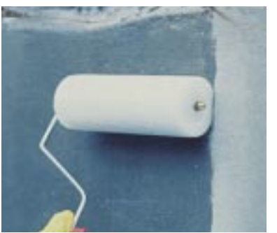
Weatherproofing. SEALER AC for long-lasting protection against the effects of weather. Improves resistance against freezing and salt interaction.